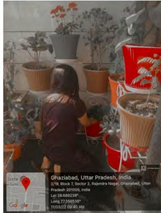
Ghazibad UDIN GAR Ghazibad, Uttar Pradesh, India 2/19, Block 7, Sector 2, Rajendra Nagar, Ghazibad, Uttar Pradesh 201006, India Lat 28.888239° Long 77.366538° 11/03/22 09:45 AM