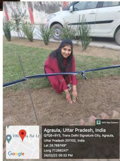
Agraula, Uttar Pradesh, India Q7Q8+8V3, Trans Delhi Signature City, Agraula, Uttar Pradesh 201102, India Lat 28.788749° Long 77.266241° 24/02/22 05:32 PM