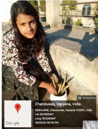
Chanduwas, Haryana, India 9644+9H6, Chanduwas, Haryana 123501, India Lat 28.955554° Long 76.598064° 28/02/22 05:29 PM