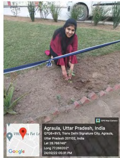
Agraula, Uttar Pradesh, India Q7Q8+8V3, Trans Delhi Signature City, Agraula, Uttar Pradesh 201102, India Lat 28.788748° Long 77.266202° 24/02/22 05:31 PM