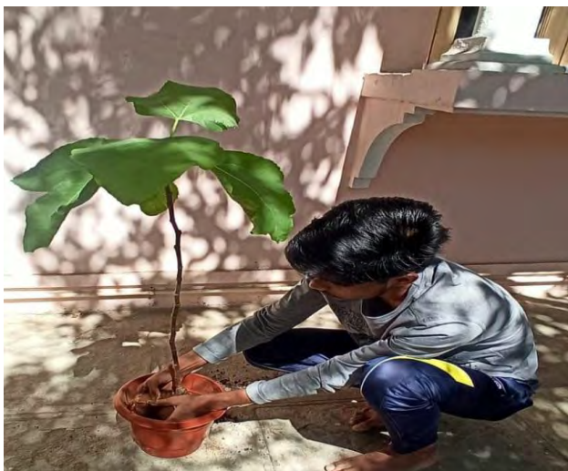
GPS Map Camera Ghaziabad, Uttar Pradesh, India Supertech Eco Village 2 Tower B-11, SUPERTECH ECO VILLAGE-2, Eco Village 2, Bhangel, Ghaziabad, Uttar Pradesh 201009, India Lat 28.611341° Long 77.443764° 11/03/22 06:51 PM