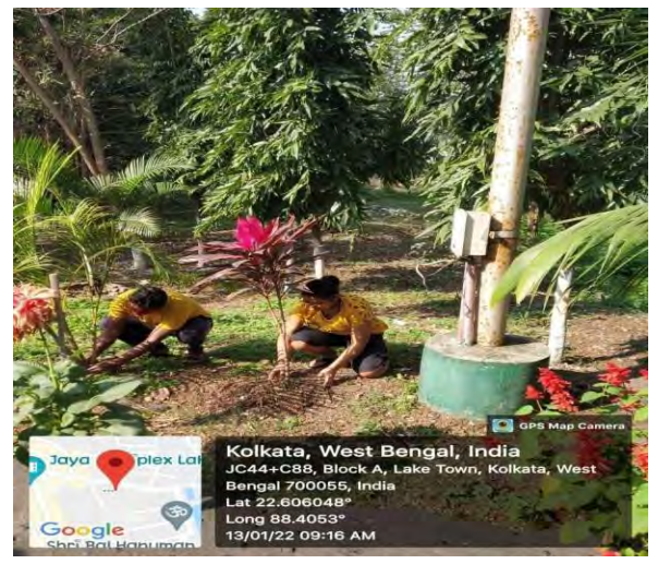
GPS Map Camera Kolkata, West Bengal, India JC44+K86, Block A, Lake Town, Kolkata, West Bengal 700055, India Lat 22.606048° Long 88.4053° 13/01/22 09:16 AM