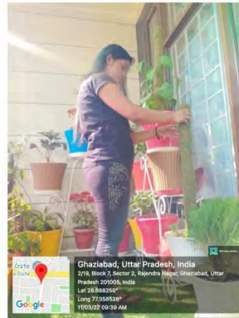
Ghazibad UDIN GAR Ghazibad, Uttar Pradesh, India 2/19, Block 7, Sector 2, Rajendra Nagar, Ghazibad, Uttar Pradesh 201006, India Lat 28.888255° Long 77.358528° 11/03/22 09:39 AM