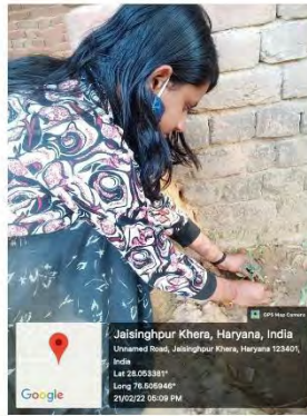
Jaisinghpur Khera, Haryana, India Unnamed Road, Jaisinghpur Khera, Haryana 123401, India Lat 28.053881° Long 76.508946° 21/02/22 06:09 PM