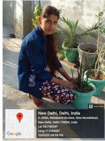
New Delhi, Delhi, India A-288A, Mahalaxmi Enclave, New Mustafabad, New Delhi, Delhi 110090, India Lat 28.718509° Long 77.274455° 10/03/22 04:58 PM