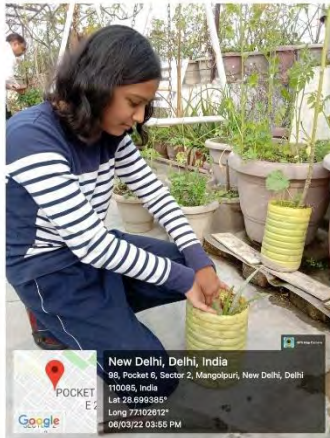
POCKET E2 New Delhi, Delhi, India 96, Pocket 6, Sector 2, Mangolpuri, New Delhi, Delhi 110085, India Lat 28.699385° Long 77.102812° 06/03/22 03:56 PM