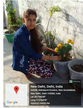
New Delhi, Delhi, India A262B, Mahalaxmi Enclave, New Mustafabad, New Delhi, Delhi 110090, India Lat 28.718539° Long 77.274479° 10/03/22 04:53 PM