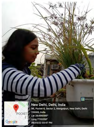
POCKET E2 New Delhi, Delhi, India 96, Pocket 6, Sector 2, Mangolpuri, New Delhi, Delhi 110085, India Lat 28.699395° Long 77.10259° 06/03/22 03:47 PM