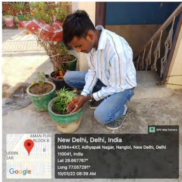
AMAN PUR BLOCK B UDIN GAR New Delhi, Delhi, India M3944-4X7, Adhyapak Nagar, Nangloi, New Delhi, Delhi 110041, India Lat 28.667767° Long 77.057291° 10/03/22 08:38 AM