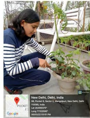
POCKET E2 New Delhi, Delhi, India 96, Pocket 6, Sector 2, Mangolpuri, New Delhi, Delhi 110085, India Lat 28.699375° Long 77.102669° 06/03/22 03:51 PM