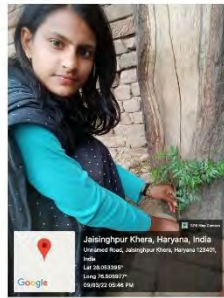
Jaisinghpur Khera, Haryana, India Unnamed Road, Jaisinghpur Khera, Haryana 123401, India Lat 28.053881° Long 76.508946° 09/03/22 05:46 PM