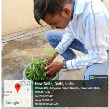
AMAN PUR BLOCK B UDIN GAR New Delhi, Delhi, India M3944-4X7, Adhyapak Nagar, Nangloi, New Delhi, Delhi 110041, India Lat 28.667582° Long 77.057167° 10/03/22 08:40 AM