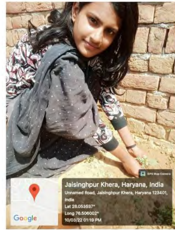
Jaisinghpur Khera, Haryana, India Unnamed Road, Jaisinghpur Khera, Haryana 123401, India Lat 28.053837° Long 76.509002° 10/03/22 01:19 PM