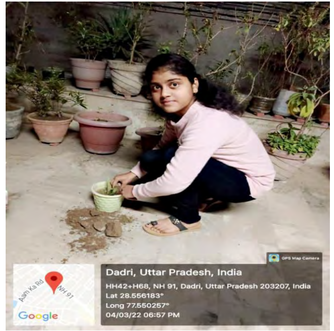
GPS Map Camera Dadri, Uttar Pradesh, India HH42+H68, NH 91, Dadri, Uttar Pradesh 203207, India Lat 28.566183° Long 77.550257° 04/03/22 06:57 PM