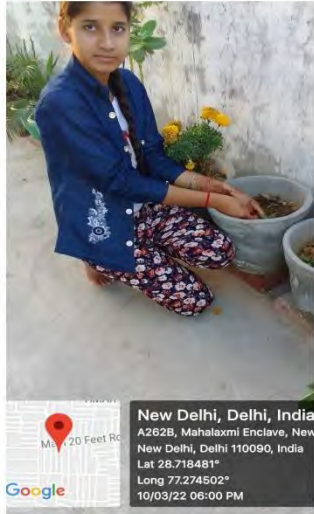
New Delhi, Delhi, India A262B, Mahalaxmi Enclave, New New Delhi, Delhi 110090, India Lat 28.718481° Long 77.274502° 10/03/22 06:00 PM