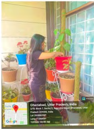
Ghazibad UDIN GAR Ghazibad, Uttar Pradesh, India 2/19, Block 7, Sector 2, Rajendra Nagar, Ghazibad, Uttar Pradesh 201006, India Lat 28.888259° Long 77.36659° 11/03/22 09:40 AM