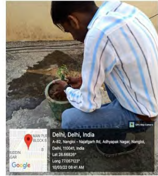
AMAN PUR BLOCK B UDIN GAR Delhi, Delhi, India A-42, Nangloi - Najafgarh Rd, Adhyapak Nagar, Nangloi, Delhi, 110041, India Lat 28.66829° Long 77.057123° 10/03/22 08:41 AM